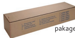
package linear m 25