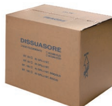
package linear m 50-100