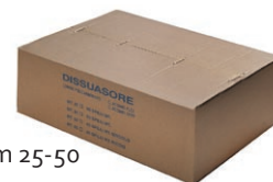
package linear m 25-50