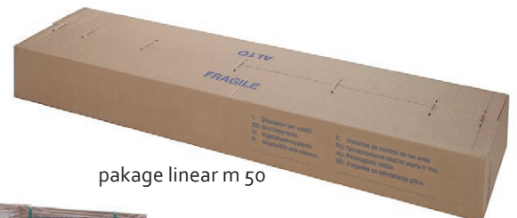
package linear m 50