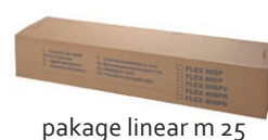
package linear m 25