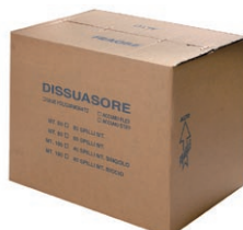
package linear m 50-100