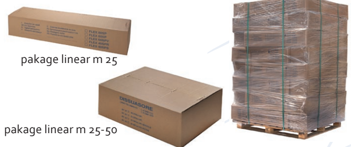
package linear m 25