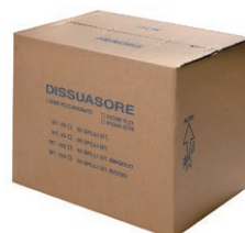
package linear m 50-100