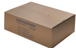
package linear m 25-50